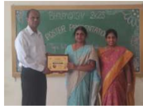
Quiz & Posters for Bhavanotsav-2023