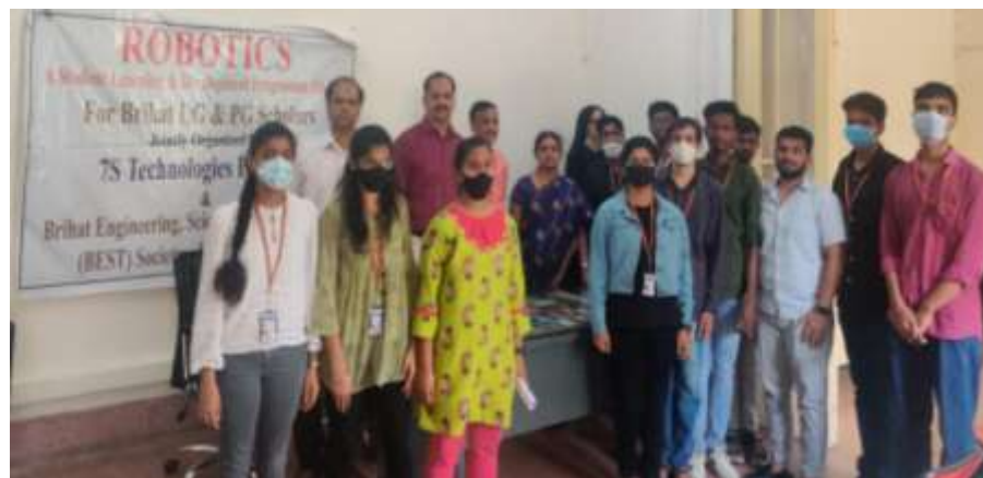
At 7S Technologies Pvt. Ltd