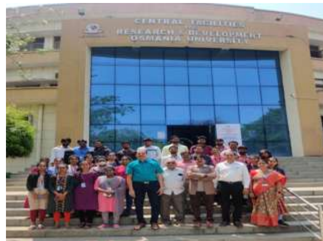
CFRD, Osmania University