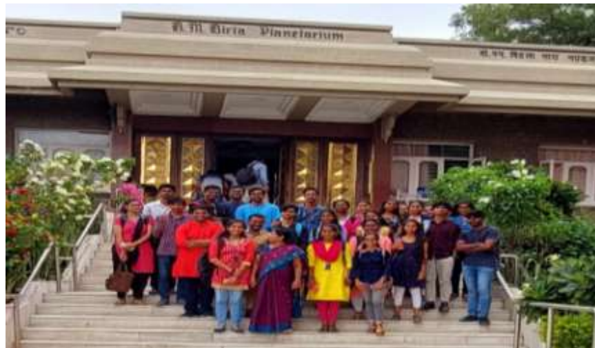
Visit to Birla Planetarium