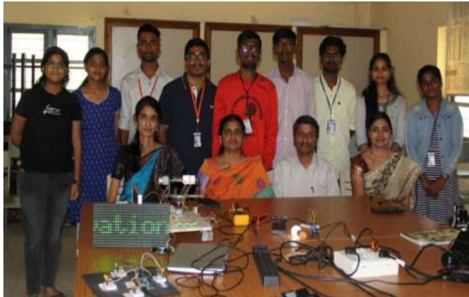
Technovation - An intercollegiate project presentation