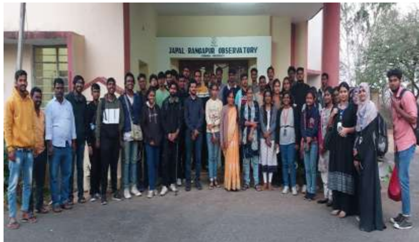
At Rangapur Observatory