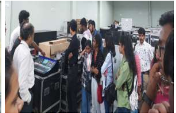
Visit to Robotics Labs at Ramoji Film City