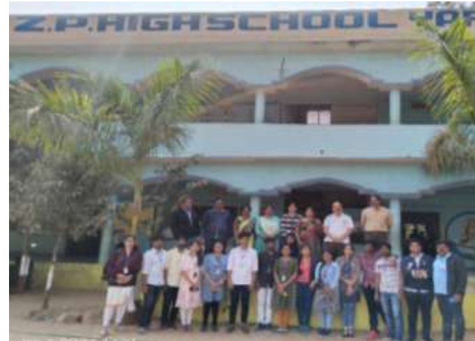
At Zilla Parishad High School, Yapral.