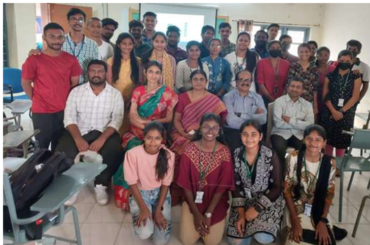
Workshop on Embedded Systems for Robotics & IoT