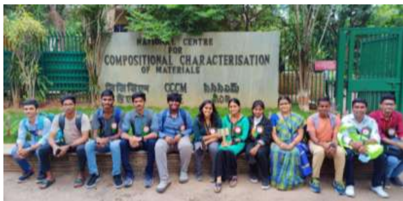
At National Centre for Compositional Characterization of Materials