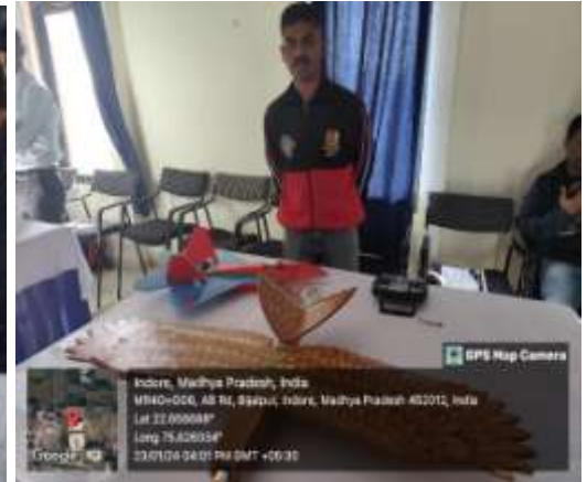
Students @ Prof. Babulal Saraf Memorial National IPSA Science exhibition, Indore