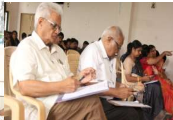
Lunar Soiree: An Inter Collegiate Event is organized by "Vyoma": The Bhavan's Astronomy Club