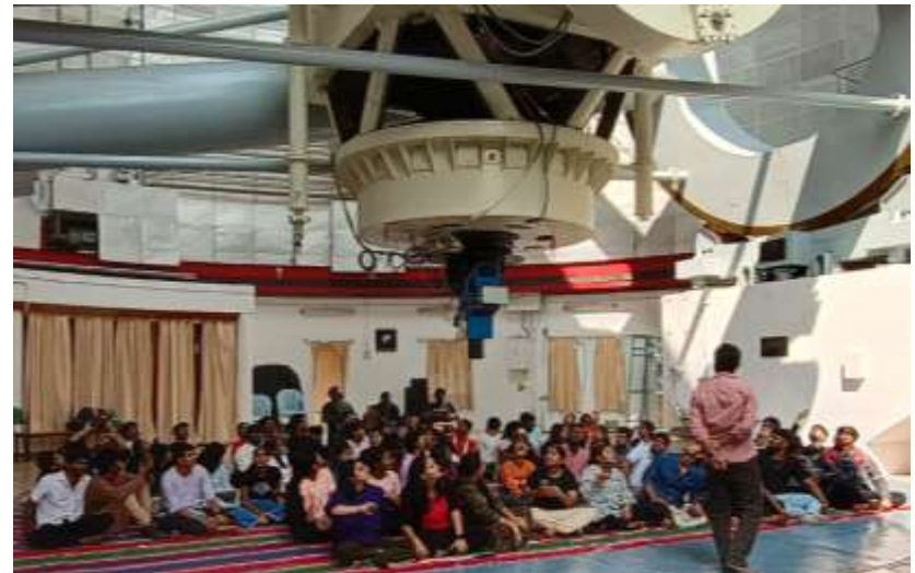
Visit to IITM Chennai, Vainu Bappu Observatory