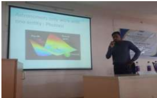
Guest Lectures on National Science Day-2023